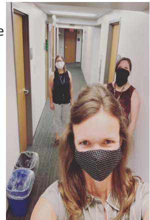
Pictured above: The Expanded Registry team, safely social distancing to bring you this year's Virtual DIAD Family Conference.

Thank you to all who participated in the virtual conference this year!